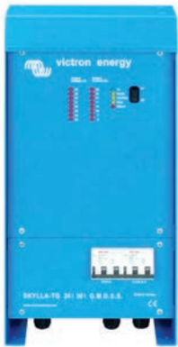
Skylla TG 24 30 GMDSS